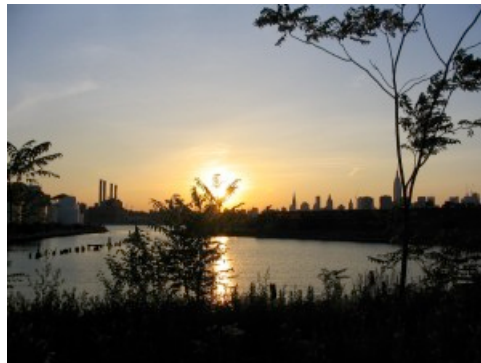
Privately owned Brooklyn waterfront: for now, out of public park's reach.

The East River waterfront where Williamsburg meets Greenpoint is a jewel in the city's plan to open the shore of North Brooklyn to the public – and the city's Department of Parks and Recreation is paying dearly for it. The Bloomberg administration is now obligated to pay more than $122 million to acquire waterfront land from two private property owners. Yet two years ago, city lawyers had claimed the property was worth only $20 million.