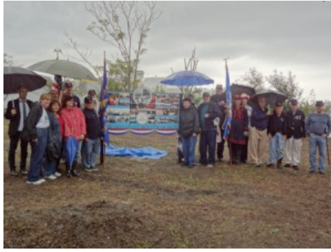
In October, the Greenpoint Monitor Museum unveiled a sign on a plot of waterfront its directors vow not to sell.